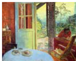
"Dining Room in the Country" (1913) Pierre Bonnard (1867-1947)

Pierre Bonnard was a French painter, illustrator, and printmaker, known especially for the stylized decorative qualities of his paintings and his bold use of color. Intimism (see Page 6 ) was most notably practiced by Pierre Bonnard and fellow French painter Édouard Vuillard. read more