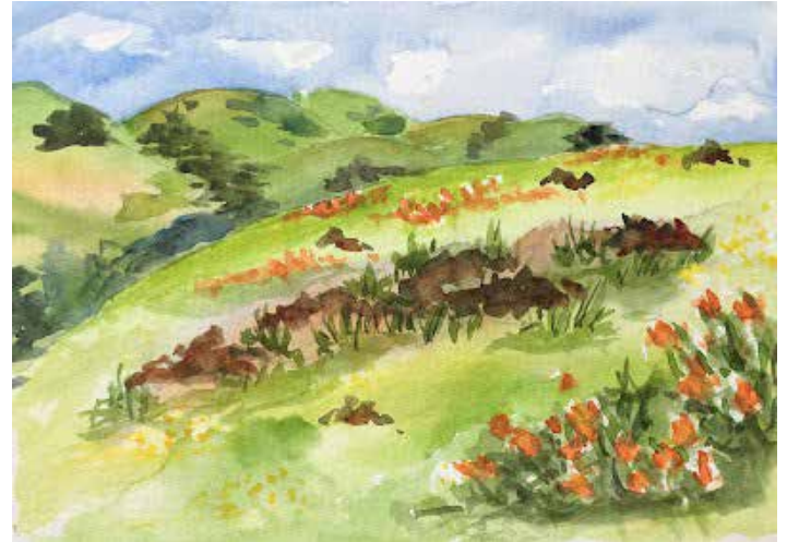
COYOTE RIDGE BY LORA CATTELL