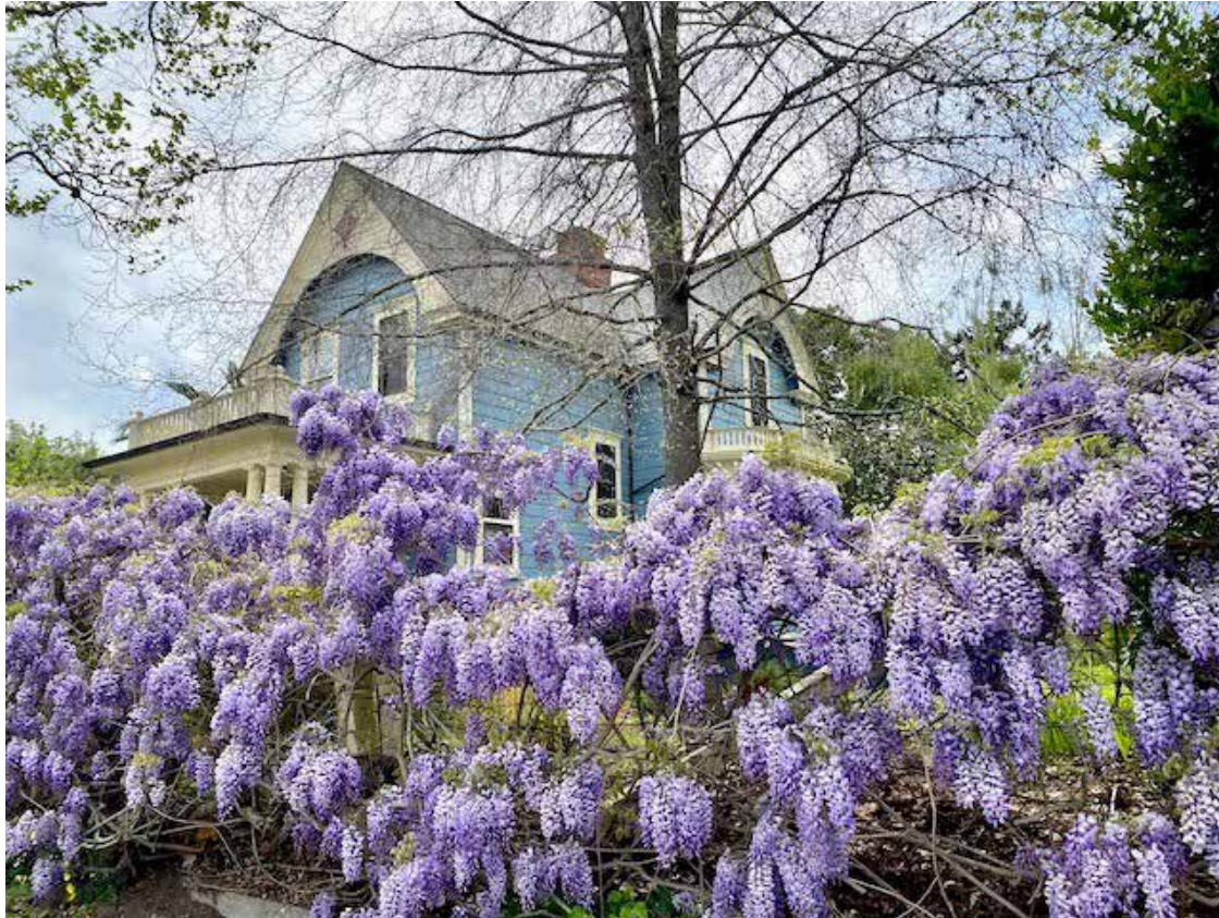
WISTERIA HOUSE IN SANTA CRUZ