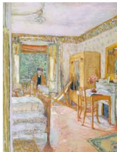
SUNLIT INTERIOR CIRCA 1920

SHARE YOUR WORD FROM THE WORLD OF ART AT NEWSLETTER@SCVWS.ORG