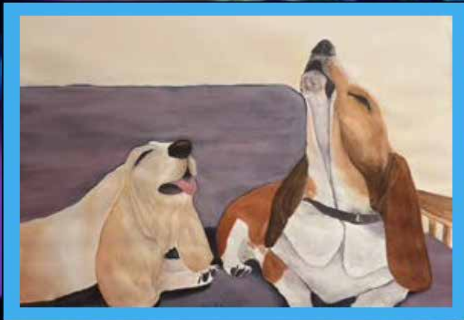
"THE DUET" BY DALE RUTZ